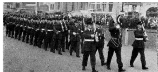
The Queen's Colour escorted through Weston-super-Mare