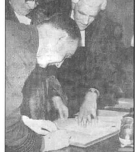
Signing the Roll